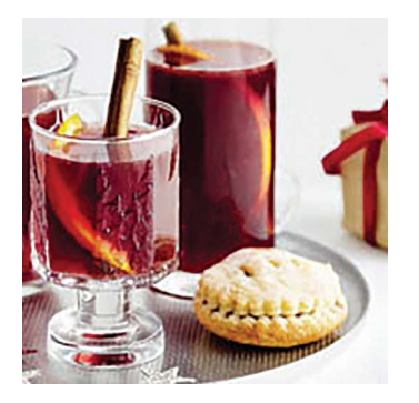
4th December 2024 Christmas Party Jacobs join, Christmas games and a chance to chat.

We would love to welcome you to our meetings either as a new member or as a visitor. We meet on the first and third Wednesday evenings of the month from September until May. Further details are available on our website: https://prestonartsociety.weebly.com/programme-24-25.html