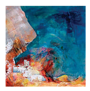
January 15th 2025 Sue Mills - Abstract in Art